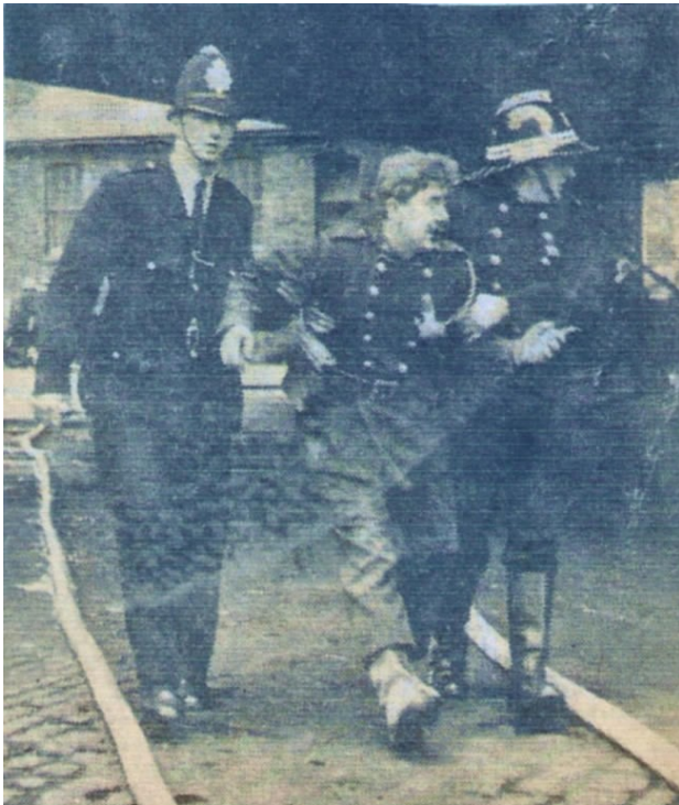
One of the firemen injured at the blaze is helped to safety by a colleague and a policeman