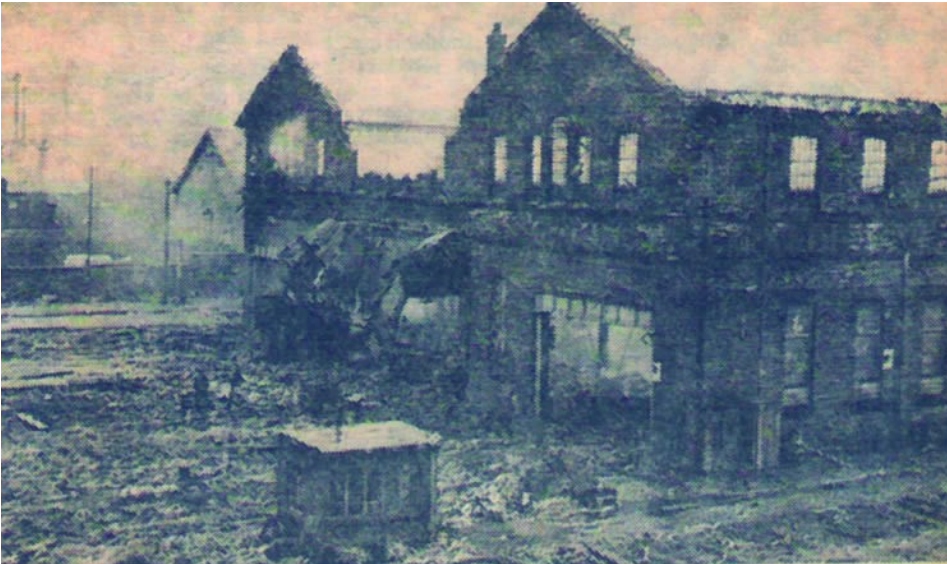
The gutted shell of the depot today, with smoke still rising from piles of debris