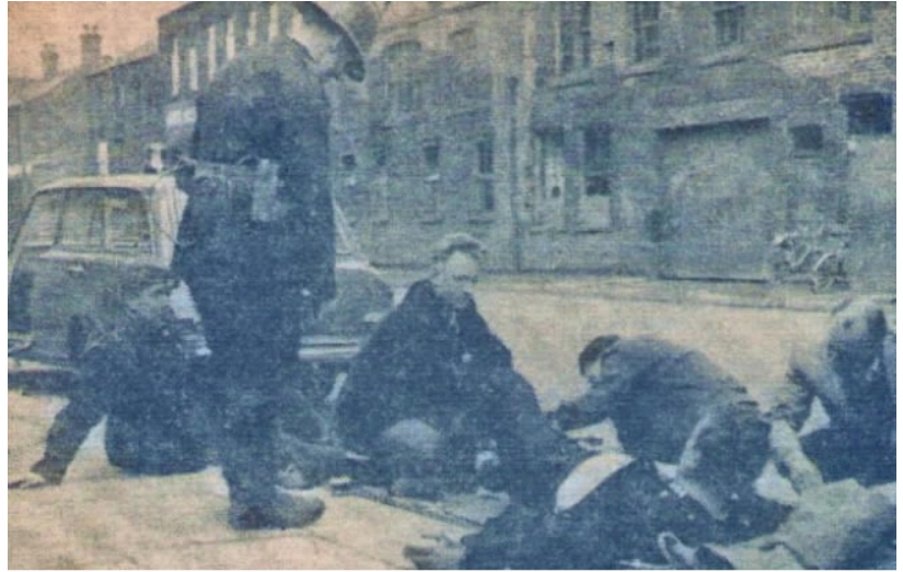
Kerbside help for more firemen injured in fighting The Wicker blaze

Until- late at night Savile Street was the scent of intense fire brigade and police activity.