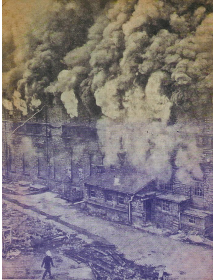
The huge blaze at the Wicker goods depot at its height. In the foreground, a Sheffield Fire Brigade officer

The red brick building was supported inside by cast iron pillars and steel beams and was roofed by glass and wood. Its shell measures about 130 paces by 70 paces.