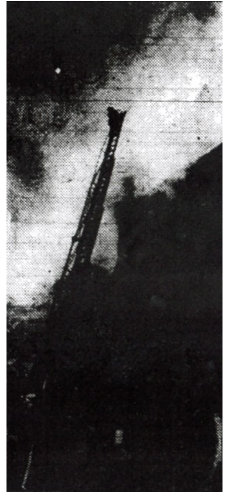
Firemen pour water through the stage roof.

This scenery, valued at £3.000 was completely destroyed but the dresses for the show, in the dressing rooms, were saved.